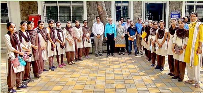
Industrial visit to Consultancy Laboratory, Pune by the 3 rd year students of Civil Engineering dept.

An industrial visit gives students practical knowledge about what they are interested in, the students will get to know the working environment in the industries, their processing, how machines are working, interact with the workers, and many more.