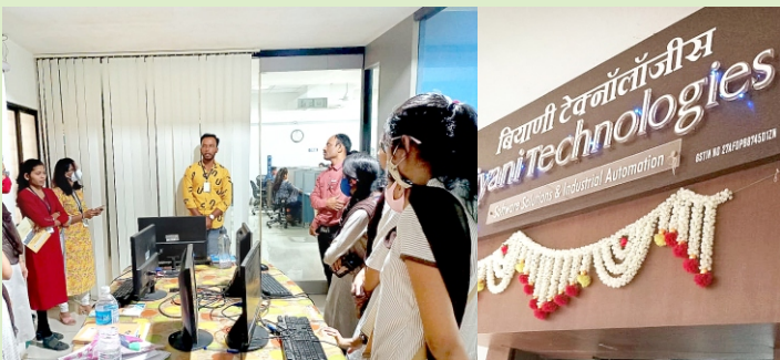
Industrial tour arranged to Biyani Technologies, Kolhapur on 11 th March 2022 for 3 rd year Computer Engg. and Information Technology students.