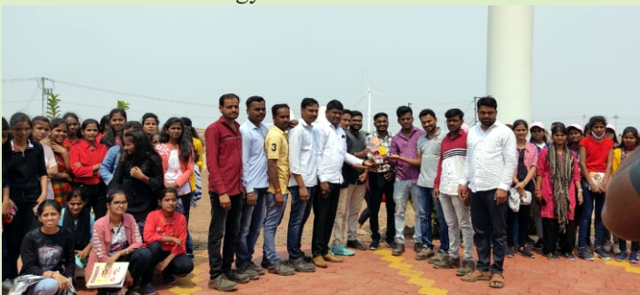
Industrial visit arranged to Regan Powertech, Wind Mill Section, Banali, Sangali for third year Electrical Engg. Dept. students.