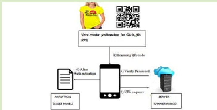
Fig.2 Identification mode

In the identification mode, when the customer will scan the QR code of the product, URL request will be sent to the server panel. Then the server panel will verify the password; after the authentication the data will be, send to the sales panel.