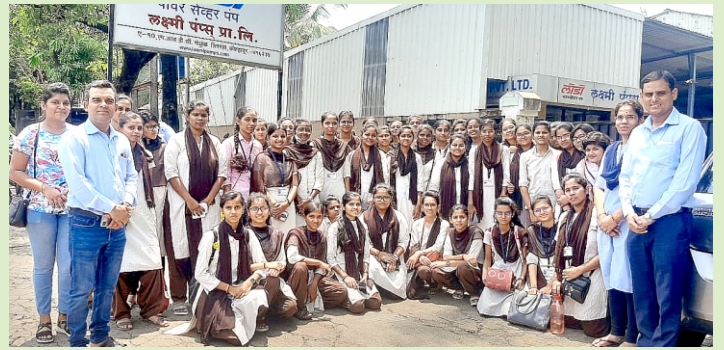
Industrial tour arranged to Laxmi Pump, Kolhapur for 2nd Year and 3 rd year of E&TC Dept.